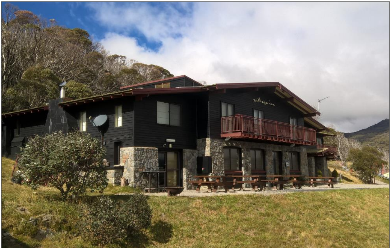
Figure 2 | Existing Guthega Inn building

The site has an area of approximately 2,799m 2 . The land is predominantly disturbed or contains native and exotic grasses, apart from a clump of native vegetation in the north-eastern corner of the allotment.