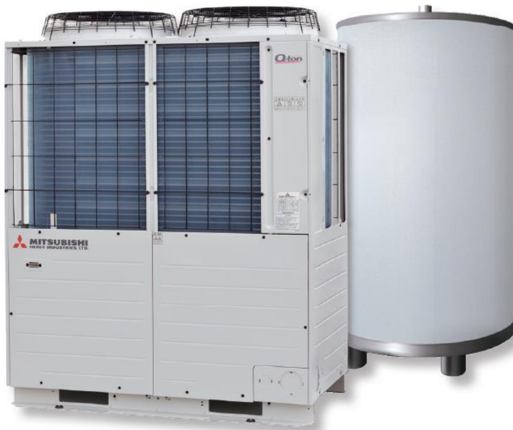
Figure 4 | Mitsubishi Heavy Industries Q-Ton heat pump

The Q-ton ( Figure 4 ) is a high efficiency, air-to-water heat pump which utilises compressor technology and CO2 gas as a refrigerant to deliver a reliable sanitary grade, hot water solution for a range of commercial applications. The Q-ton meets a range of disparate demands including the need for medium to large sanitary hot water generation. This involves low electricity consumption and a high level of environmental friendliness.